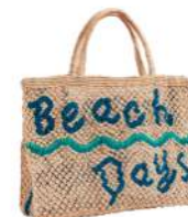
The Jacksons tote bag £75.60