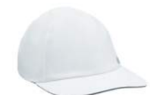
Lululemon cap £75