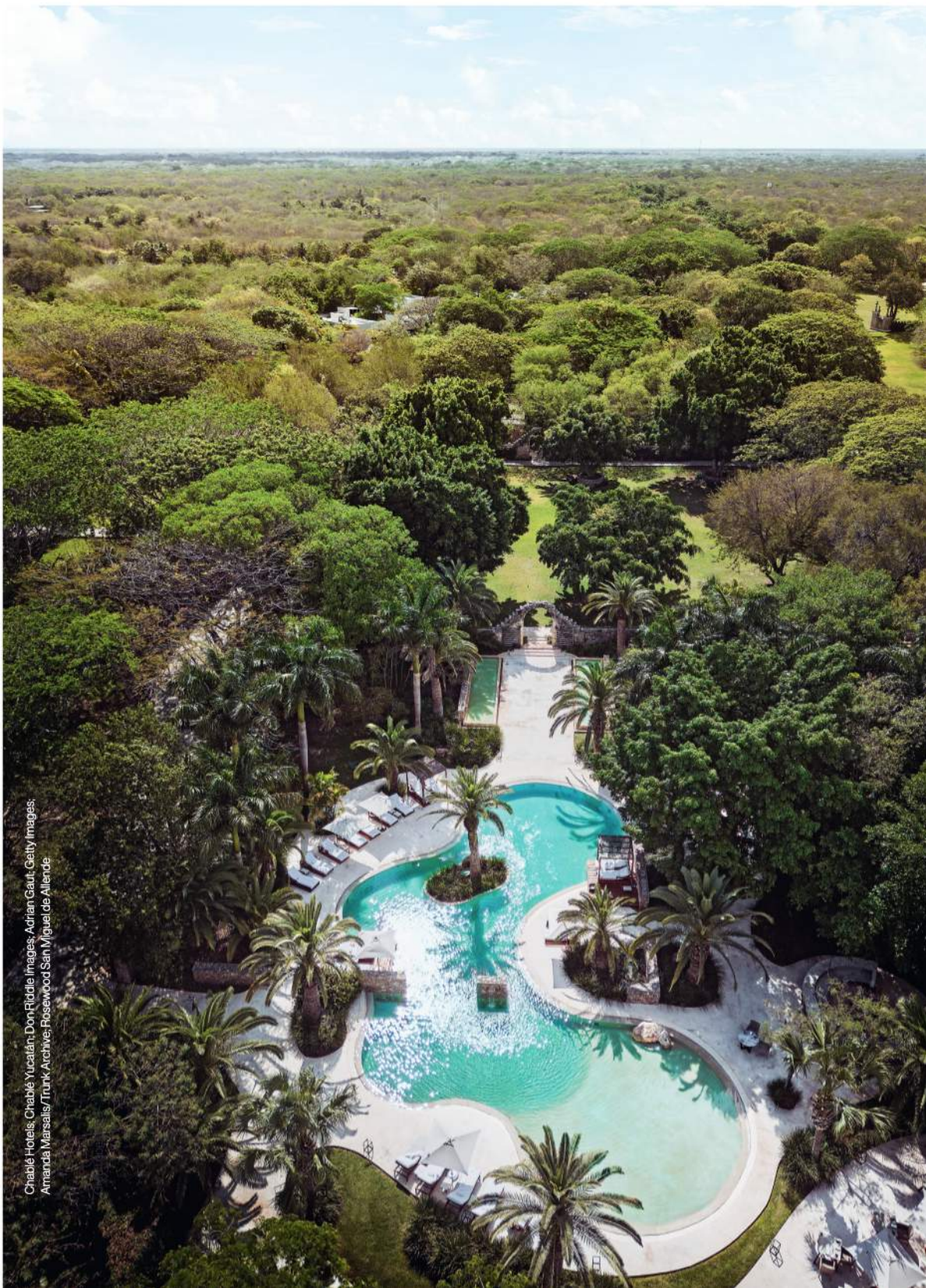
Chablé Hotels: Chablé Yucatán

“EMERGING (DOUSED WITH FREEZING WATER TO BRING ME ‘BACK TO LIFE’), I’VE NEVER FELT MORE ALIVE”