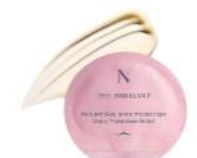
Noble Panacea The Brilliant Radiant Resilience Moisturizer 30 x 0.8ml, £210

The Beauty Halls, Ground Floor; Women’s Denim & Sport, Fourth Floor; Hair and Beauty Salon, Fifth Floor; and harrods.com