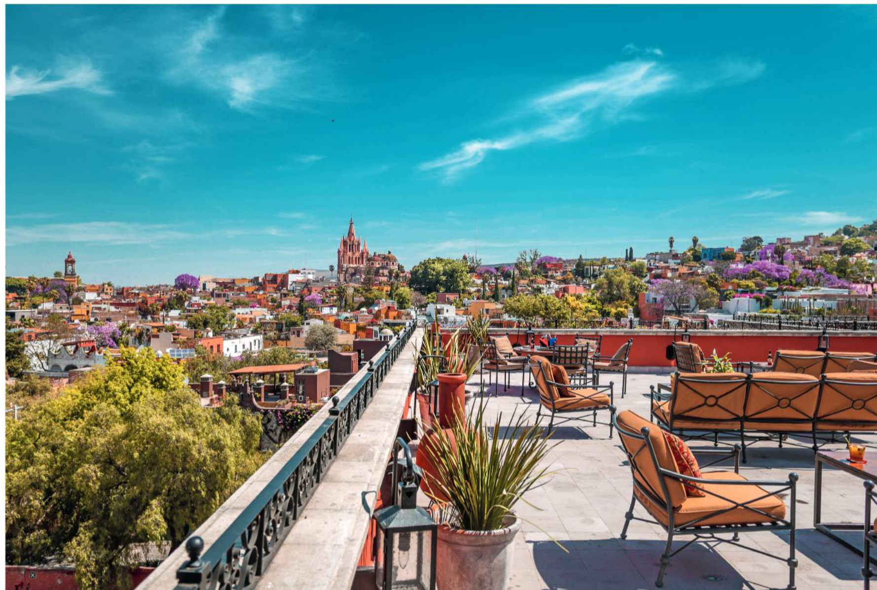
Above and top right: Mobile food stalls dot the streets of the Mexican capital, where brightly coloured buildings also feature prominently; Luna Rooftop bar offers spectacular views of San Miguel de Allende, including the dramatic pink towers of the neo-Gothic Parroquia de San Miguel Arcángel church

The Beauty Halls, Ground Floor; Women’s Denim & Sport, Fourth Floor; Hair and Beauty Salon, Fifth Floor; and harrods.com